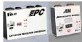
3 Mix and match modules to suit application