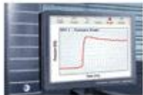
1 Fike EPWorks software provides in-depth analysis