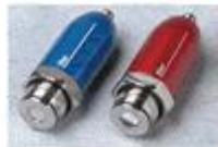
2 Fast, reliable detectors