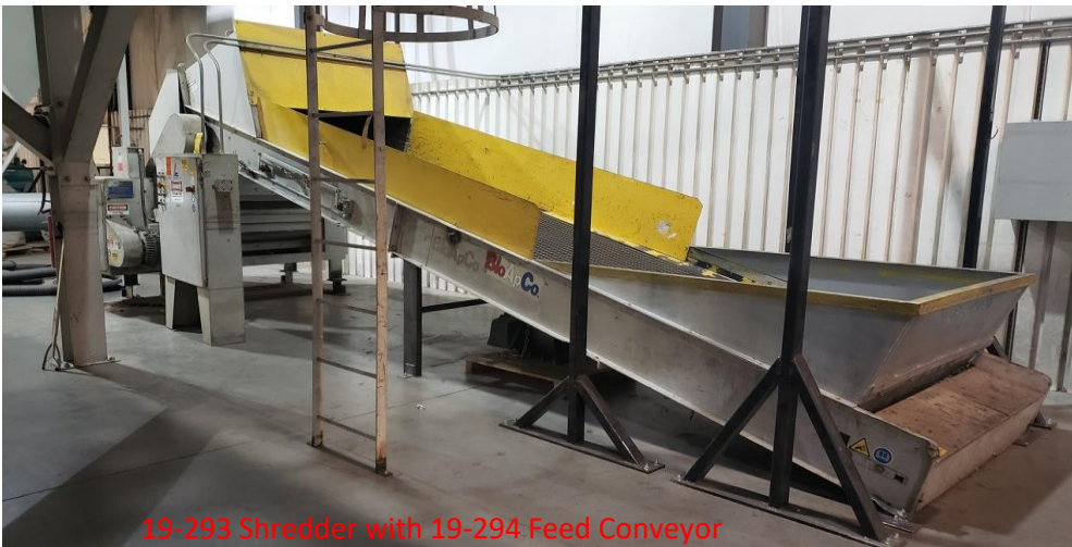
19-293 Shredder with 19-294 Feed Conveyor